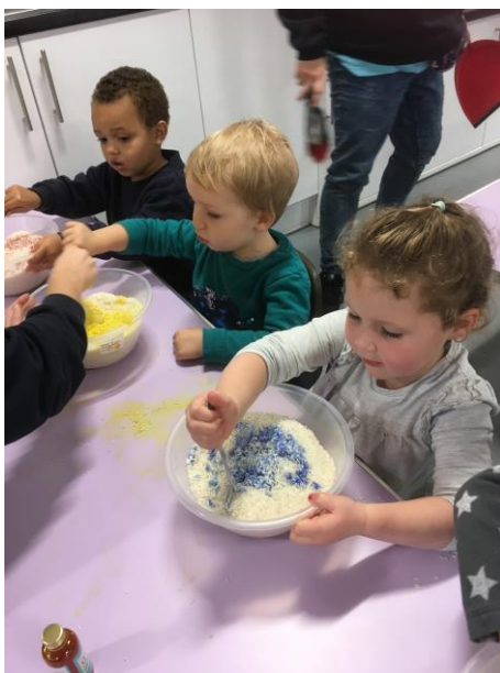
Making coloured rice.