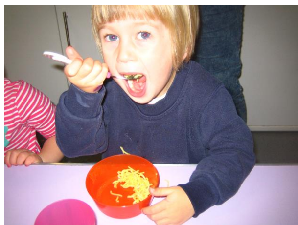
Eating noddles for snack