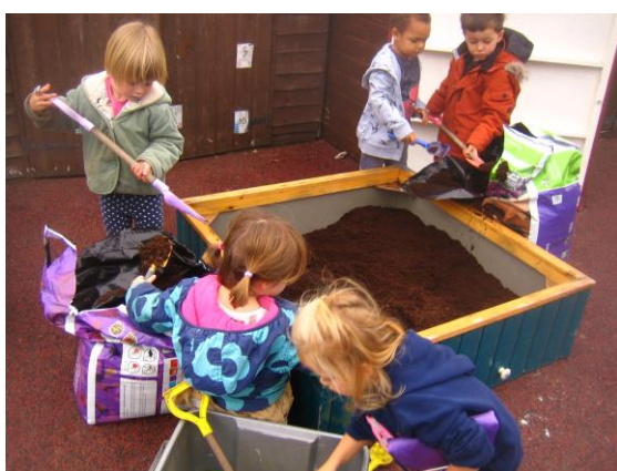
Planting our daffodil bulbs.