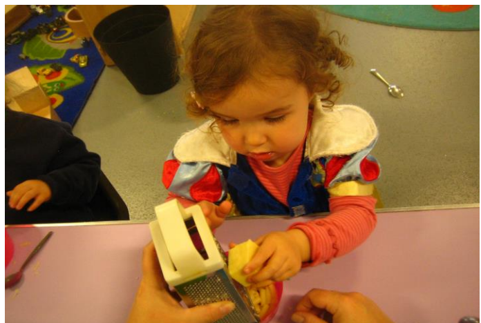
Grating cheese for the Macaroni cheese snack.