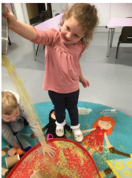
Pouring the rice sounds like it's raining.