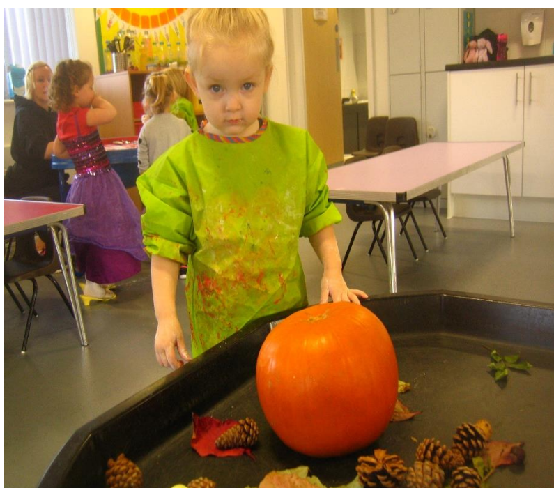
Pumpkins, conkers and cones – all things autumn