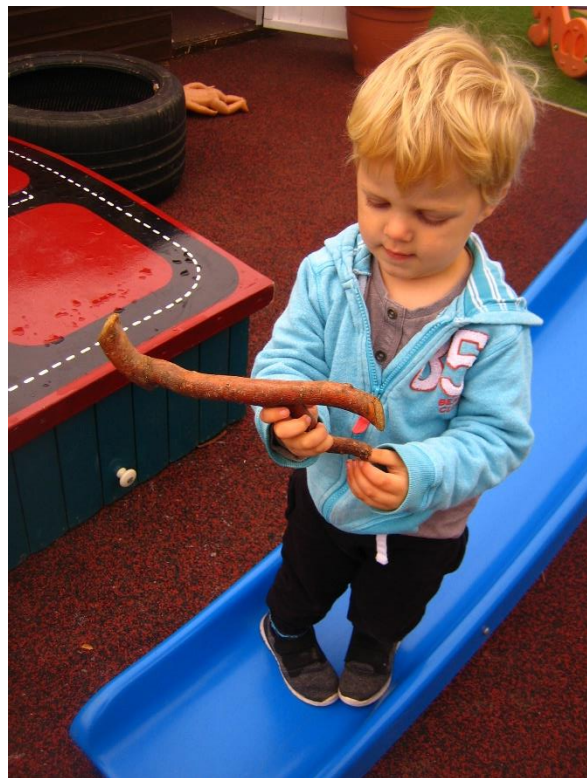
Enjoying outside play